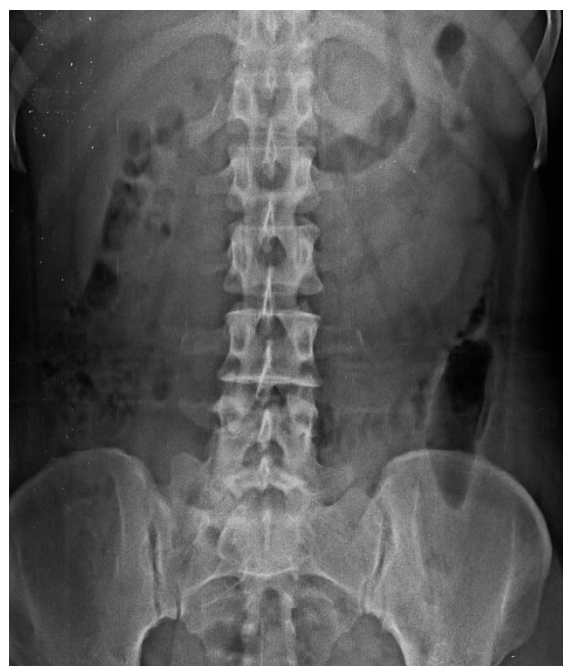
Figure 5: True articulation of right L5 transverse process – LSTV type III A.

compared to males in the older age group which could be due to the slow decline in the protective effect of estrogen in females with advancing age. The majority of the patients showed Castellvi type II which is supported by the findings of Jeffrey et al. 17 However Shaikh et al. 18 indicated the presence of transitional vertebrae with both type II as well as type III. Recent findings highlighted a similar association of LSTV with type IIA and type IIB in the