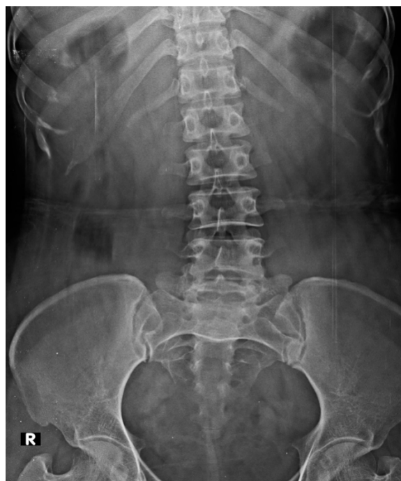
Figure 4: Pseudoarticulation of bilateral L5 transverse process – LSTV type II B.