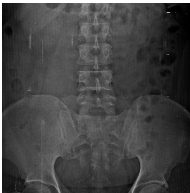
Figure 3: Pseudoarticulation of Right L5 transverse process – LSTV type II A.