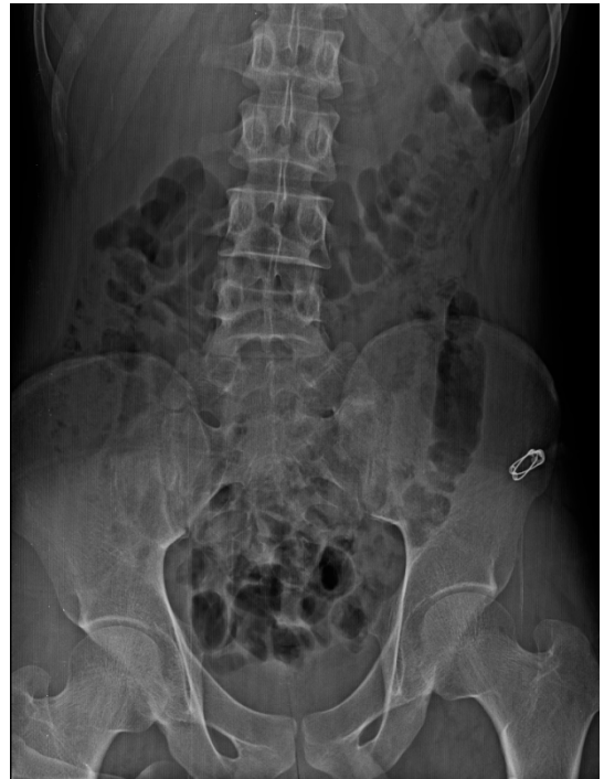
Figure 7: True articulation of left L5 transverse process and Pseudoarticulation of right L5 transverse process – LSTV type IV.