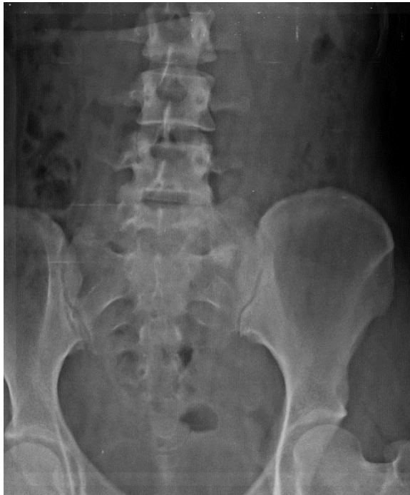
Figure 6: True articulation of right L5 transverse process – LSTV type III B.