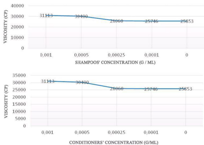
Figure 2: Graph of concentration of pigment versus viscosity of the shampoos and conditioner.