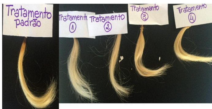
Figure 4: Hair wicks post treatment.