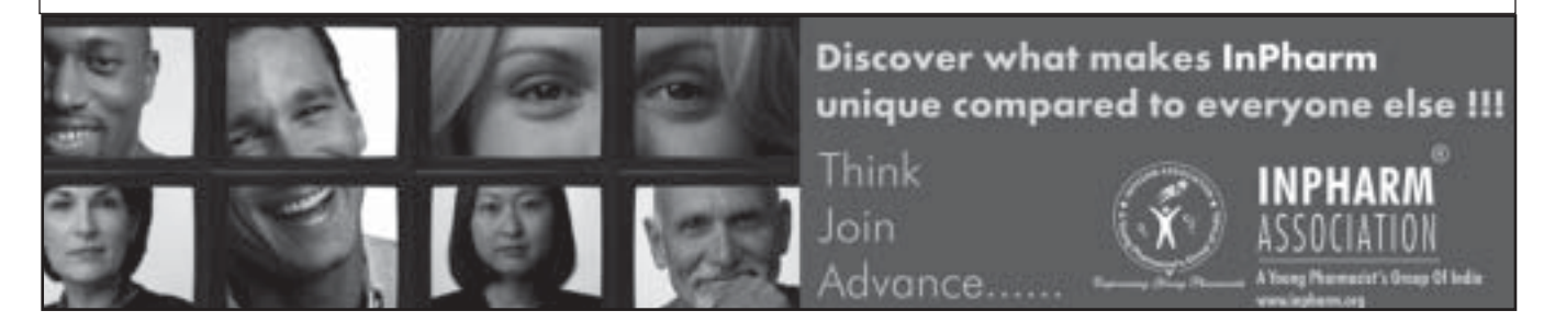
J Young Pharm Vol 1 / No 2